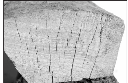
Dry Firewood will show “checking” or cracks at the end of the split

There are several ways to determine if wood is properly dried. Visual “checking” on the end of the wood splits, dry wood will feel lighter, if you bang two pieces of dry wood together it will sound hollow (wet wood will sound solid & dull), and no bubbling or sizzling from the wood as it burns. Moisture meters are a great way to determine the percentage of moisture content in wood. Moisture meters utilize two pin probes that insert into the wood and read the percentage of moisture. Moisture meters can be purchased online.