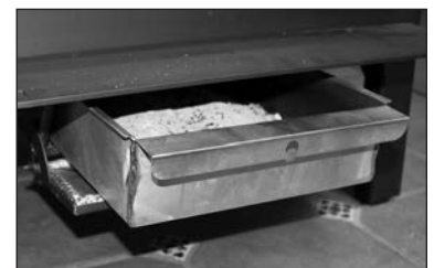
The ash pan door drops down and the ash pan slides out from under the stove for easy ash removal.

If your Absolute Steel Hybrid is in continuous operation, you will probably need to empty the ash pan every 7-10 days. You do not have to let the fire die out completely, but make sure that it is reduced to hot coals. Open the catalytic bypass damper, and open the air control damper. Remember to wear stove gloves - the ash pan will be hot! Open the ash pan door located on the same side as, and below the loading door. Carefully slide the lid into place on the top of the ash pan and remove the ash pan from the base of the stove. The lid slides over the long top edges of the ash pan. Close the ash pan door before emptying the ashes into an appropriate container.