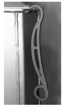
Fall-Away Tool shown hanging off the stove.

The "fall-away tool", which comes with your stove, can be used to operate the door latch and the bypass lever. Simply insert the tool into the door handle circle to use to safely open/close the loading door. The loading door and the door handle are very hot, so use the tool provided. The "fall-away tool" conforms to UL requirements and is made so that if you let go of it, it will "fall-away" from the stove and not become too hot to handle.