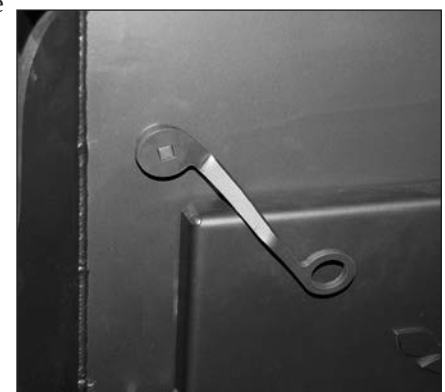
The bypass lever interlocks with the door when the combustor is engaged (bypass closed). This safety feature makes it impossible to open the loading door without opening the bypass.

NEVER BURN THE STOVE WITH THE AIR DAMPER FULLY OPEN EXCEPT WHEN KINDLING A FIRE OR RELOADING THE FIREBOX. NEVER BUILD A ROARING FIRE IN A COLD STOVE. IT TAKES AT LEAST 30 MINUTES TO HEAT THE INNER SOAPSTONE PANELS OF THE ABSOLUTE STEEL HYBRID. ATTEMPTS TO REACH HIGH TEMPERATURES VERY QUICKLY COULD RESULT IN DAMAGE TO THE STEEL OR SOAPSTONE PARTS.