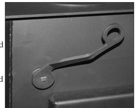
Bypass lever should be up when starting or reloading the Absolute Steel. Allowing the smoke to heat up to 500° F