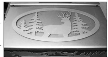
The top plate comes in several styles and can be used as a trivet for cooking.

Your connector pipe and chimney, or chimney pipe, should be inspected at regular intervals (not less than once every two months). Examine the connector pipe for creosote, corrosion, loose seams, or excessive soot. Clean and replace as necessary. The chimney or chimney pipe should be cleaned and checked by a certified specialist once a year. A small mirror held at the cleanout door of a masonry chimney will be helpful. For a Class A prefabricated metal pipe, some disassembly is usually required.