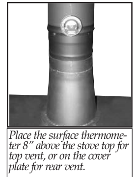
Place the surface thermometer 8" above the stove top for top vent, or on the cover plate for rear vent.

Once the combustor is engaged, you should see the stove surface temperature rise and the pipe temperature stabilize, then drop, indicating catalytic combustor activity. From a cold start it may take about 30 minutes to get the stove up to temperature. If you are reloading a hot stove, wait approximately 5-15 minutes before engaging the combustor. The thermometer is not a precise instrument – it will not tell you the exact temperature inside the firebox or in the flue.