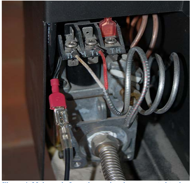
Figure 4: Male spade from the receiver box connected to the red capped female spade connector.