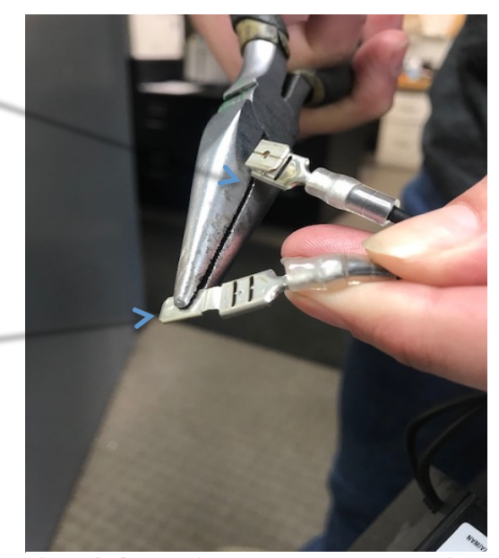
Figure 3: One receiver box spade connector will become a male fitting and the other will be left female