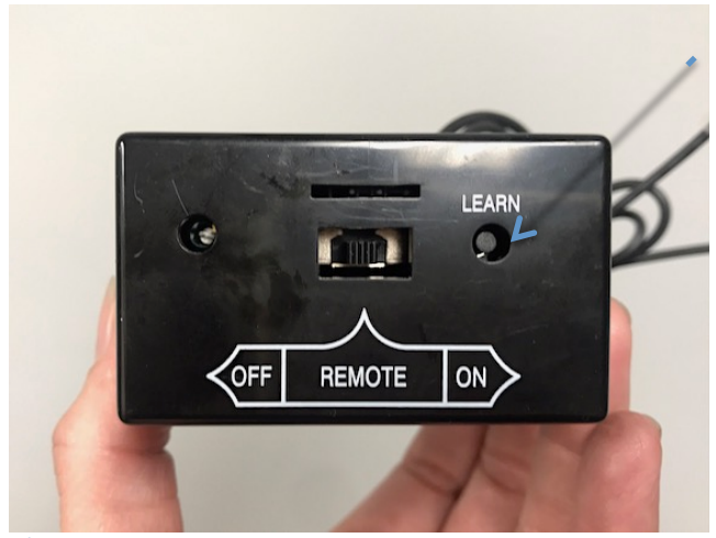
Figure 7: Depress and release the learn button