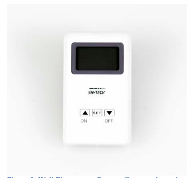
Figure 9: Wall Thermostat: Repeatedly press the set button