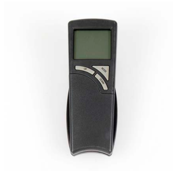
Figure 8: Remote: Repeatedly press the mode button